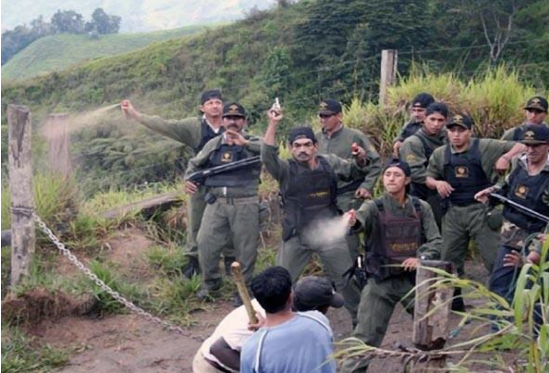
7. Police attacking mining resisters at Intag, Ecuador