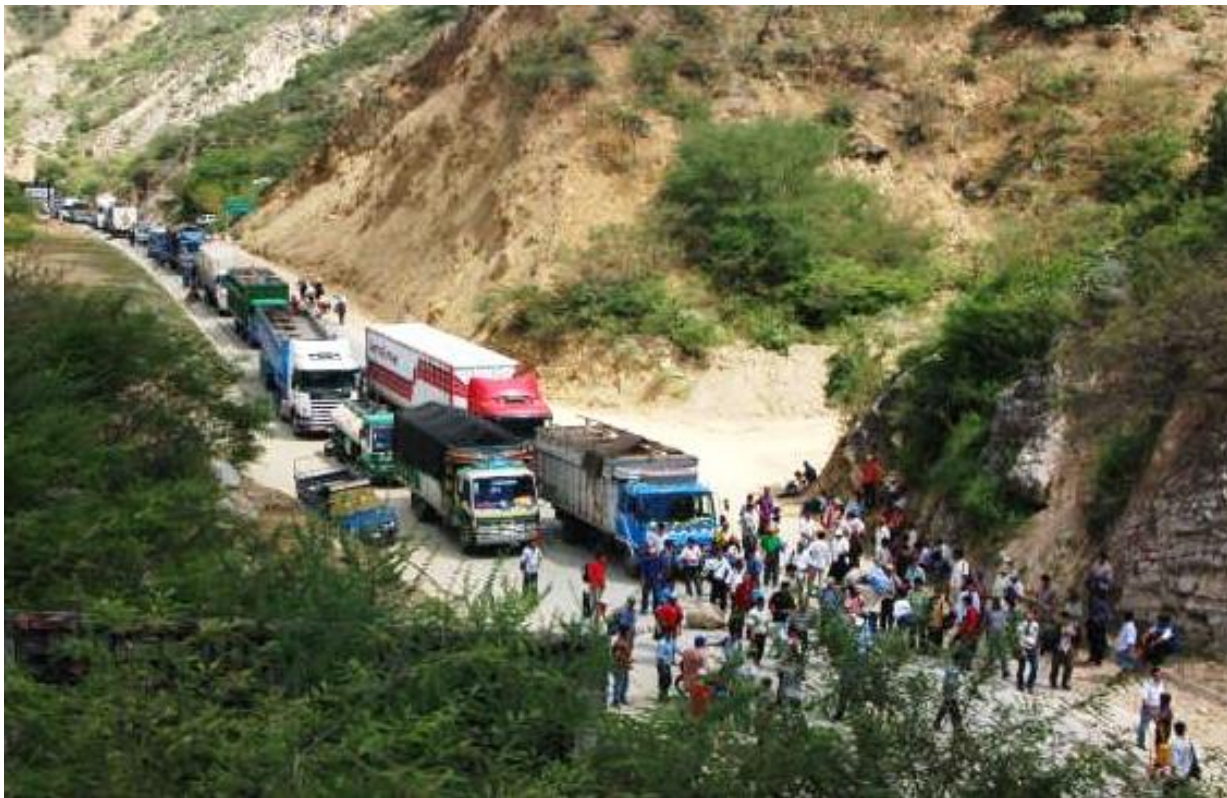
8. Indigenous people resisting mining operations in the Amazon, Peru