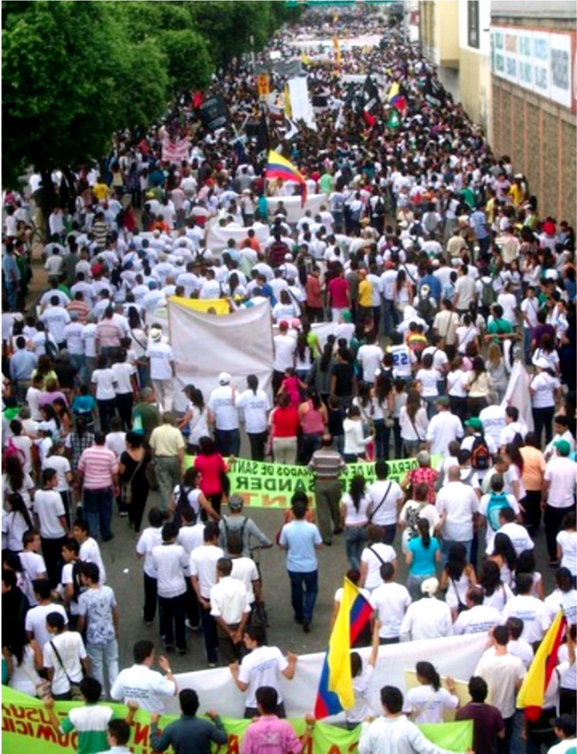
9. Resisting mining in Colombia.