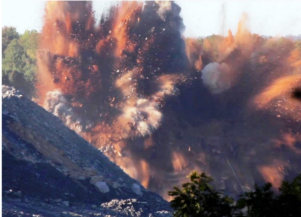
2. Strip mining using explosives, another source of contamination. Millions of kg of explosives yearly are sometimes used. (Photo: Alabama, U.S.)