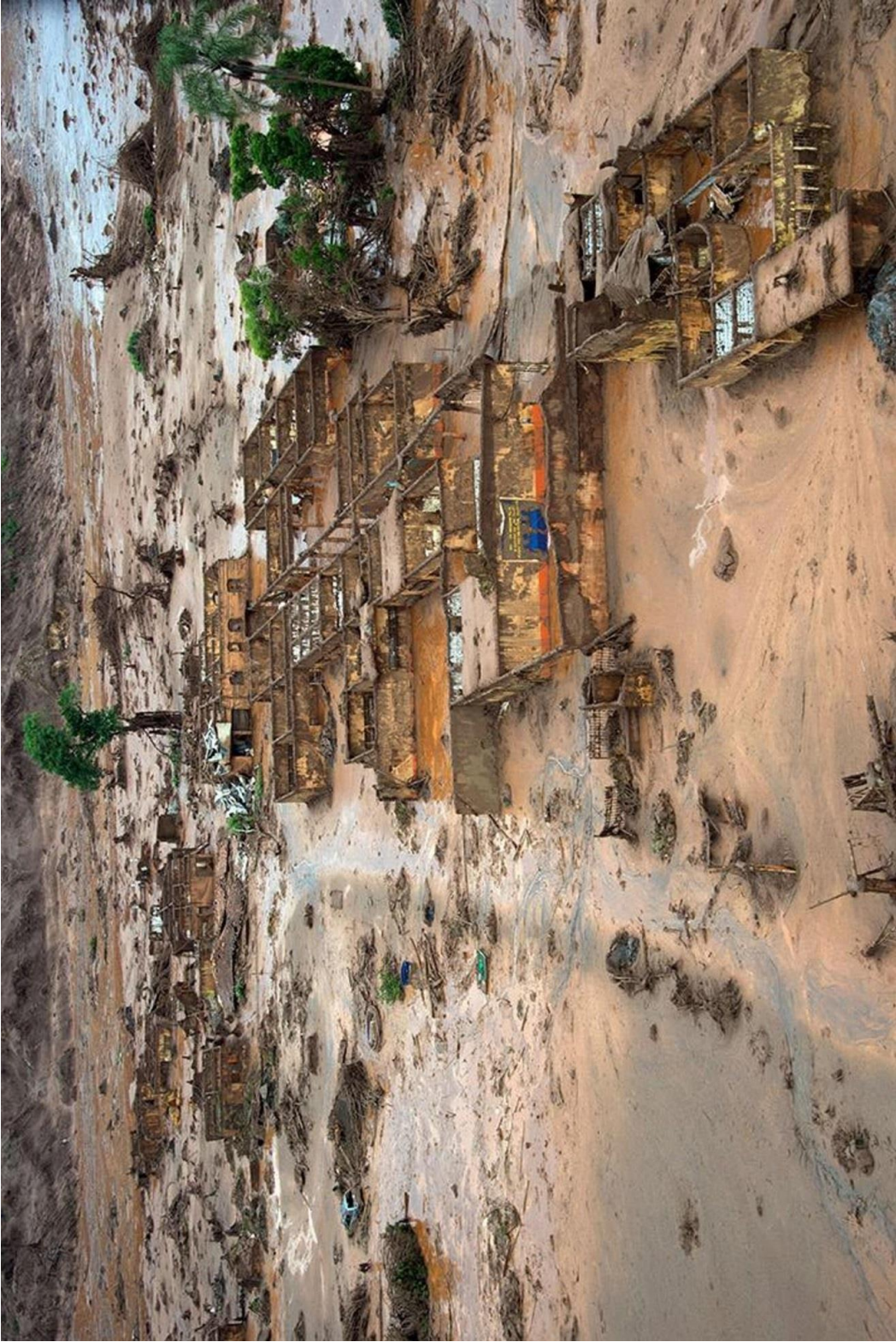
6. Village destroyed and people killed by poisonous mud from a collapsed mine tailings dam (Mariana, Brazil)