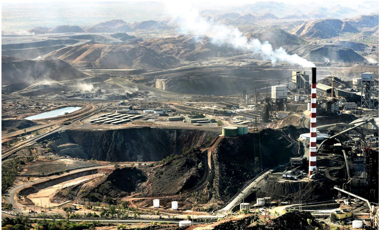
3. Copper smelter in Indonesia. Smelters release deadly poisons into the air, soil, and water.