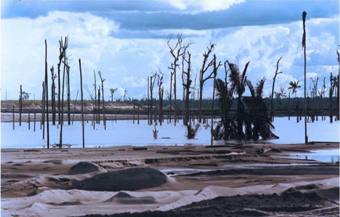
4. This was once a luxuriant tropical forest, now poisoned by mine wastes.