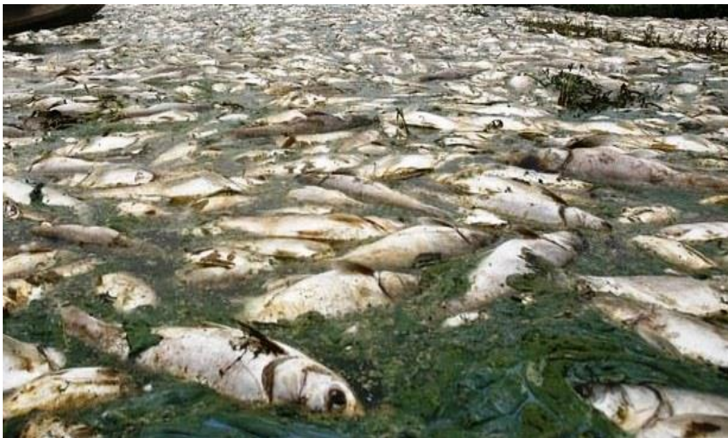
5. Fish killed by contaminated water. (China Environmental News)