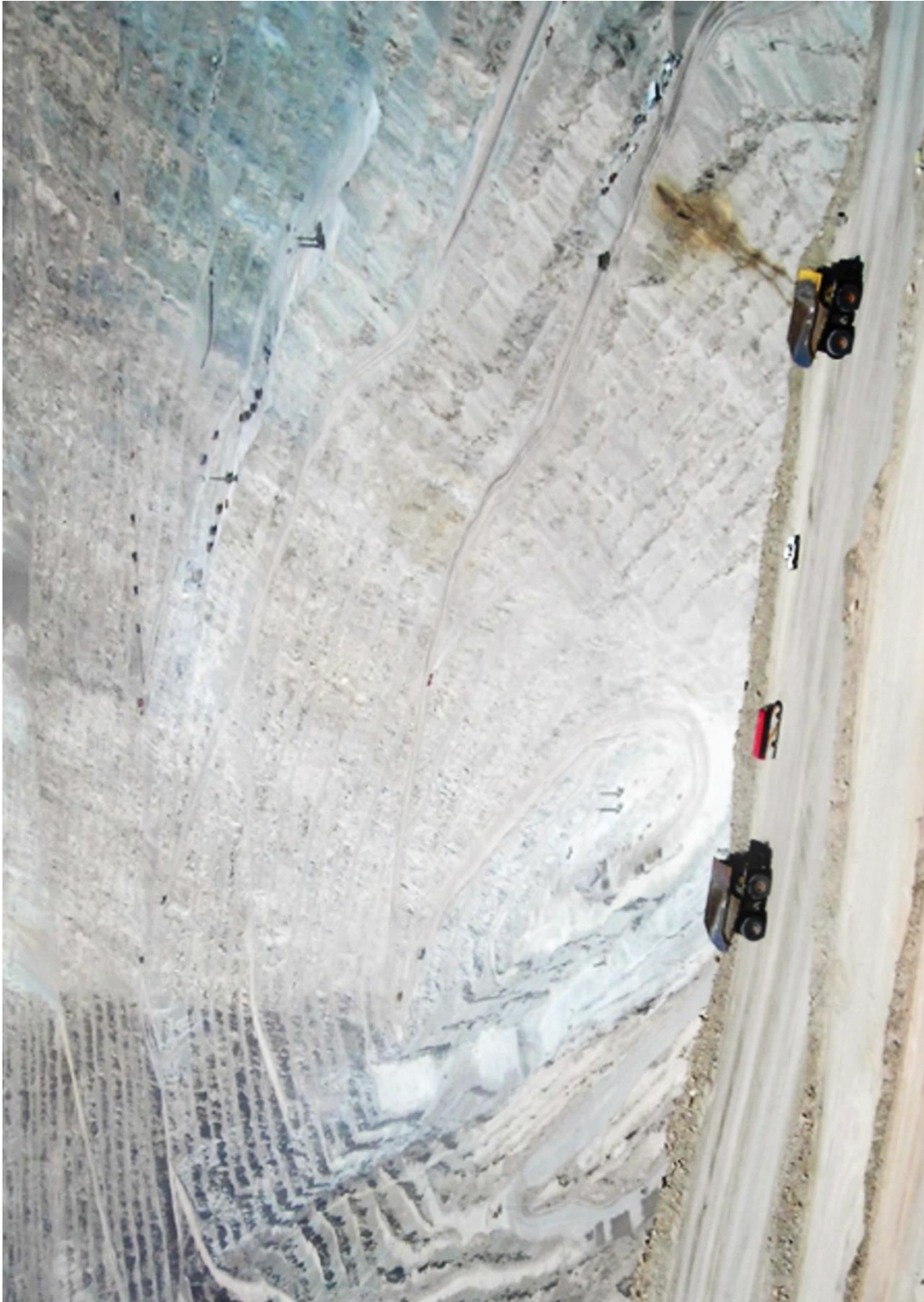
1. Copper Mine in Peru. The rows of dots in the distance are enormous trucks. The white vehicle in foreground is a pickup truck. This is only a small part of the mine area.